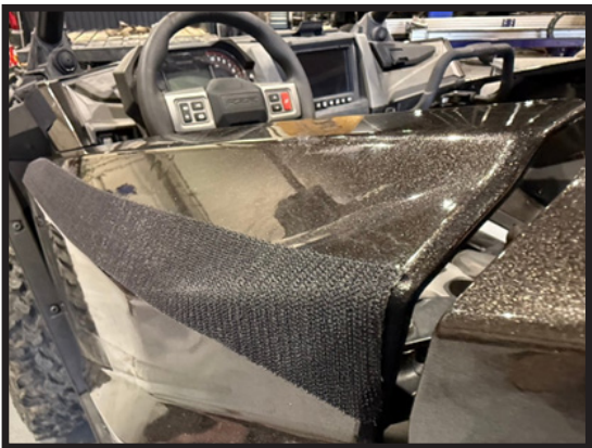
Front Driver Door