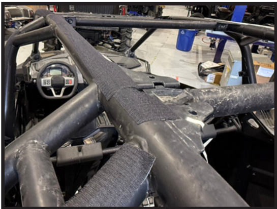
Top of ROPs