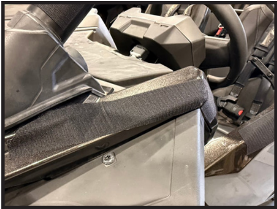
Front Side Plastics