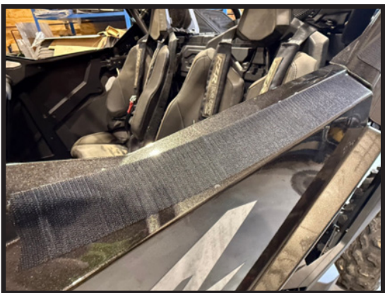
Rear Driver Door